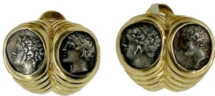
Bulgari Monete earrings in 18k yellow gold with 4 ancient Greek coins "Gallia Masilia."