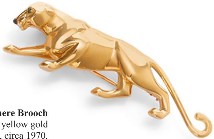
Iconic Cartier Panthere Brooch An iconic Cartier panthere pin in 18k yellow gold with emerald eyes. Made in France, circa 1970.