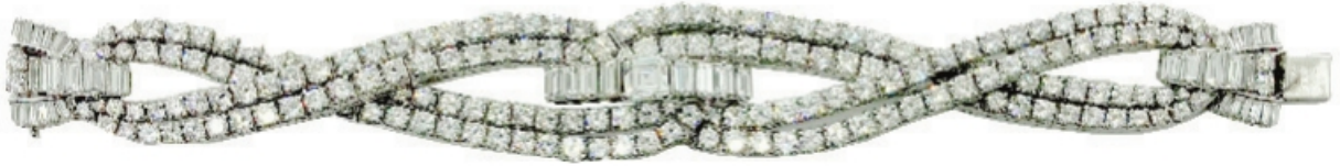
Bracelet in platinum with 33 carats of diamonds. Circa 1950.