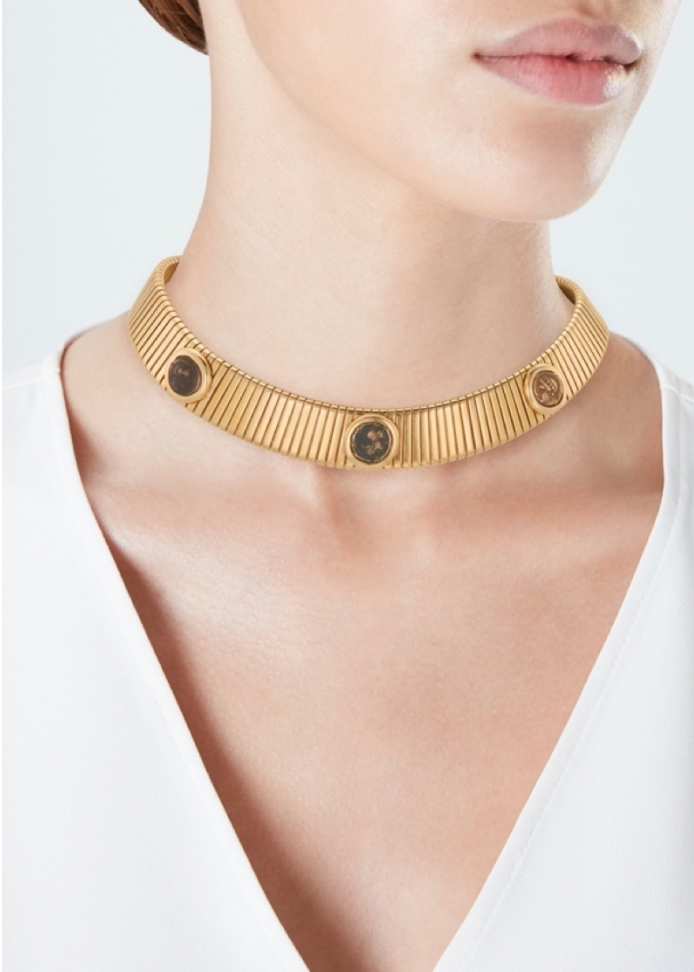
Bulgari gold and coin Monete Necklace Ancient coins, inscribed on the reverse LVCANIA - THVRION III sec. a.C., JONIA - PRIENE III sec. a.C. and ROMA III sec. a.C. EMILITRA, 18k yellow gold (Italian mark).