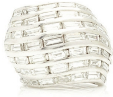
Ring with 18k white gold with baguette diamonds (3.5 cts total). Circa 1950.