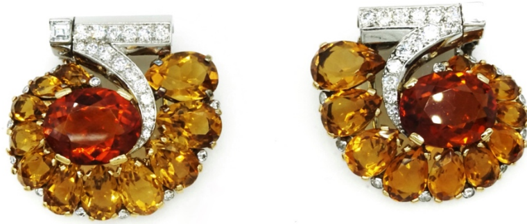
A Pair of Rare Cartier Paris Double Clips with citrines and diamonds mounted in platinum. Made in France, dated 1936. Original Certificate available