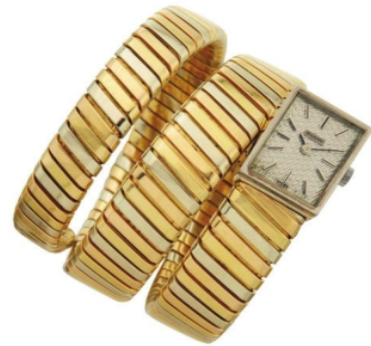
Bulgari Tubogas ladies watch in 18k yellow, white and pink gold. Made in Italy, circa 1965.