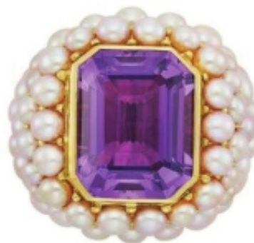
Gold, Amethyst and Freshwater Pearl Ring. Circa 1970.