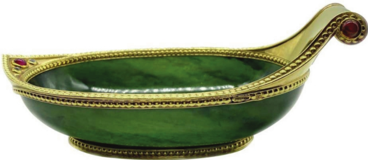
Faberge gold-mounted nephrite kovsh (traditional Russian drinking vessel) with 3 cabochon rubies and 2 Old European cut diamonds. Made in Russia, circa late 19th century.