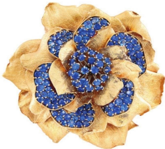
Van Cleef & Arpels flower clip-brooch in 14k rose gold, with folded petals embellished by round blue sapphires (approximately 16.90 cts). Made in New York, circa 1950.