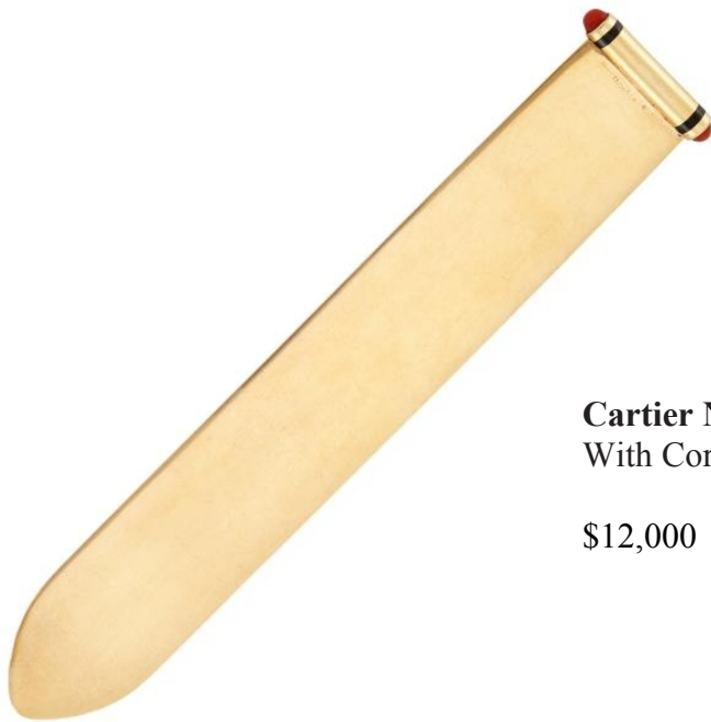
Cartier New York Gold and Coral Letter Opener With Coral and Black Enamel. Made in France.