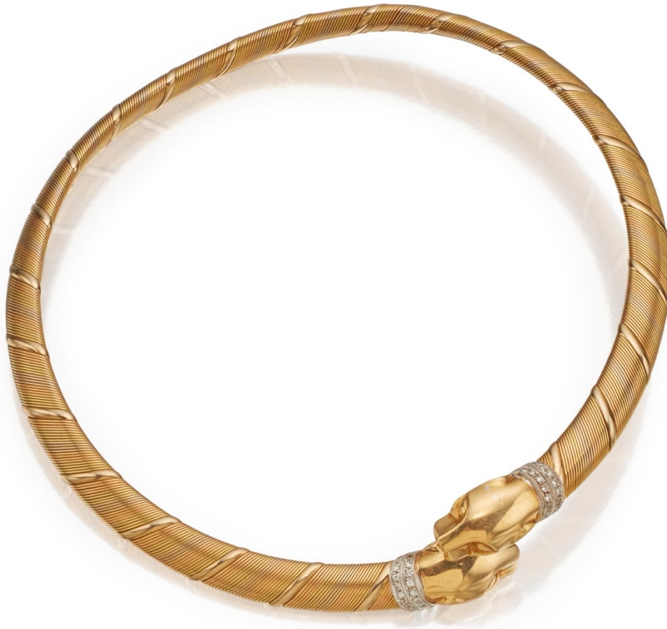
Cartier Panthère Necklace with Diamonds