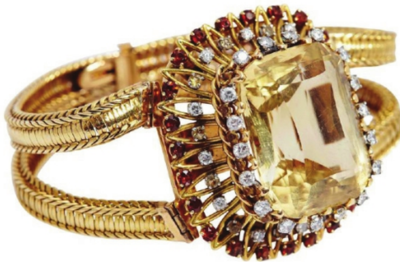
Sterle bracelet in yellow gold with a large citrine, highlighted with diamonds and garnets. Made in France, circa 1950.