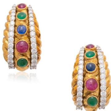
David Webb Multi-Color Gemstone Earrings

A stylish pair of 18k yellow gold earclips embellished with diamonds, emeralds, sapphires, and rubies. Made in the United States, circa 1980.