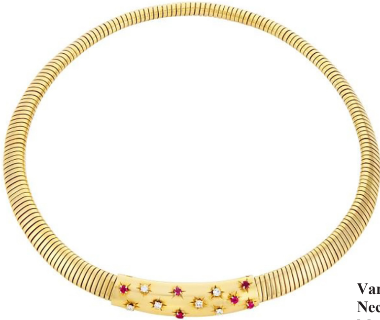
Van Cleef Retro Gold Diamond and Ruby Necklace