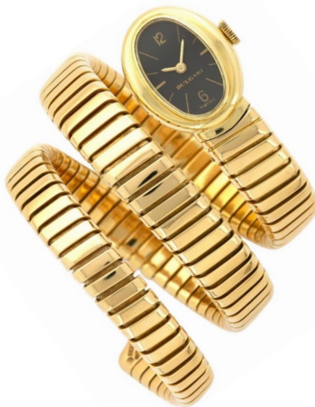
Bulgari Tubogas watch in 18k yellow with black dial. Made in Italy, circa 1970.