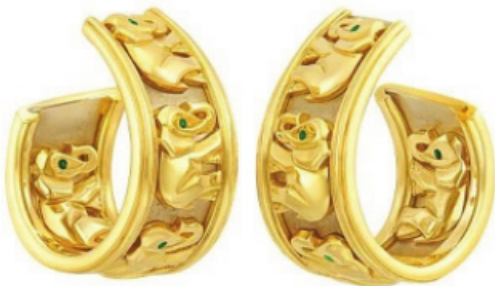
Cartier elephant hoop earclips in 18k two-color gold. Made in France, circa 1970.