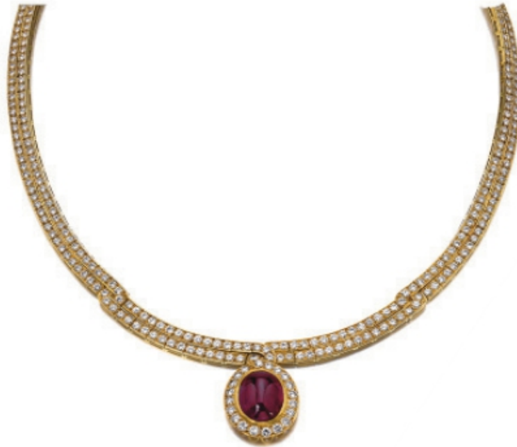
Van Cleef & Arpels necklace in 18k yellow gold, set throughout with brilliant-cut diamonds, the front accented with a cabochon ruby. Made in France, circa 1970.