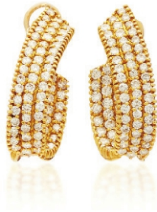
Hoop earrings in 18k yellow gold with diamonds. Made in Italy, circa 1980.