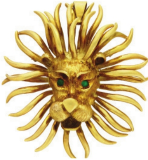
Cartier lion brooch in 18k yellow gold with emerald eyes. Can also be worn as a pendant. Made in France, circa 1970. Published in a Cartier book.