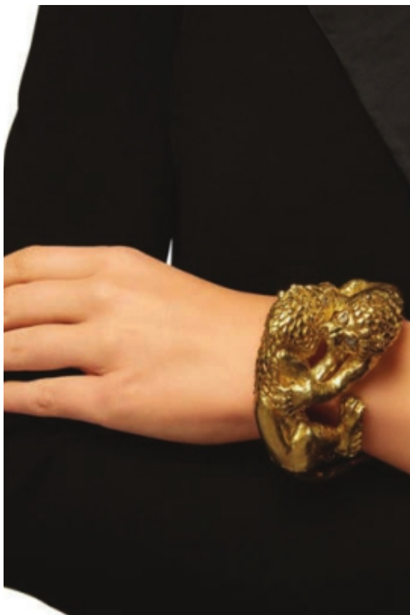
David Webb bracelet featuring textured gold two lions in battle, with pear-shaped diamond eyes. Made in the United States, circa 1970.