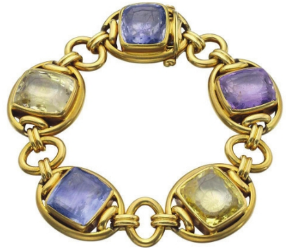
Bracelet of fancy gold linking set with variously coloured cushion-shaped sapphires, length approximately 20 cm. Circa 1970.