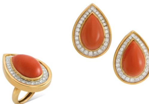
David Webb Coral & Diamond Set

A beautiful ring and earrings set featuring cabochon corals embellished with round-cut diamonds, mounted in platinum and 18k yellow gold. Made in the United States, circa 1970.