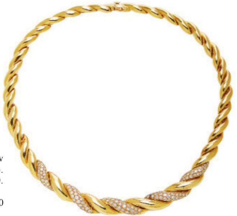
Van Cleef & Arpels necklace in 18k yellow gold with diamonds (3.25 cts.). Made in France, circa 1950.