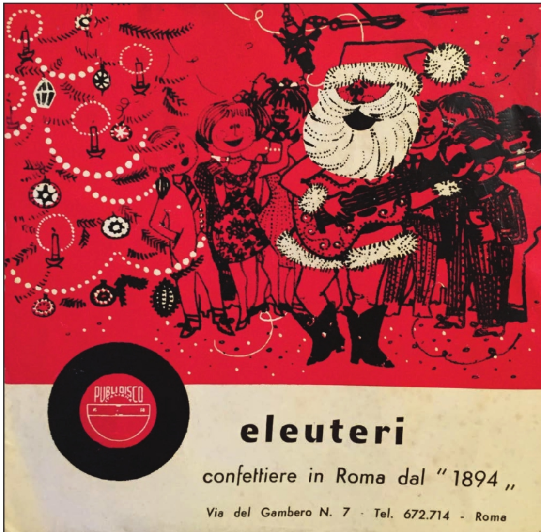
Cover of a promotional Christmas carol record, from when Eleuteri was a patisserie back in the 1960s