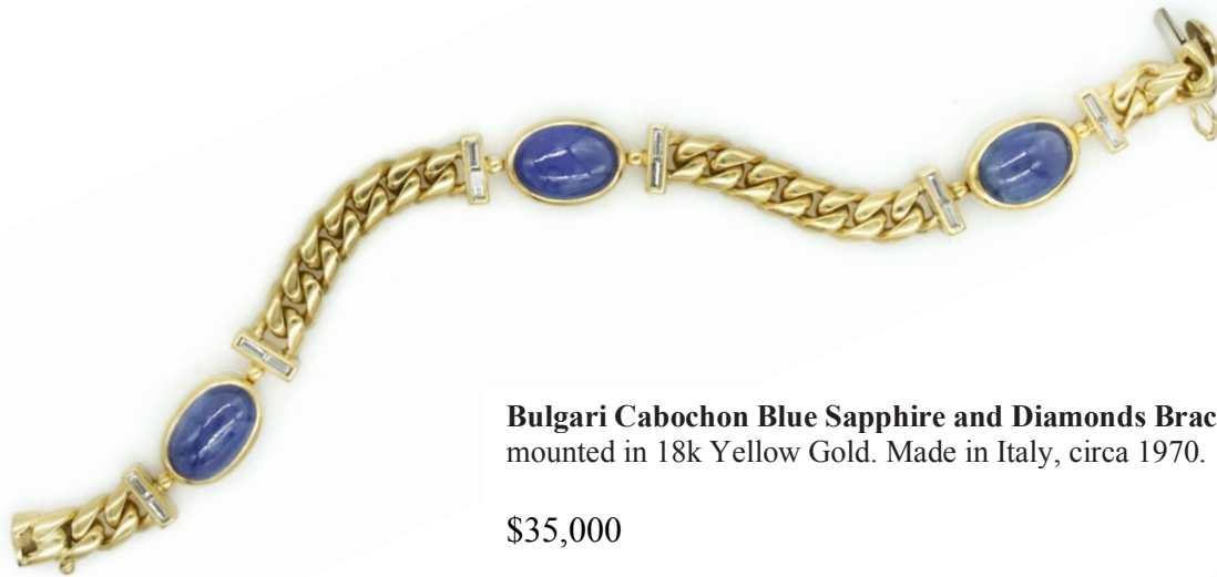
Bulgari Cabochon Blue Sapphire and Diamonds Bracelet mounted in 18k Yellow Gold. Made in Italy, circa 1970.