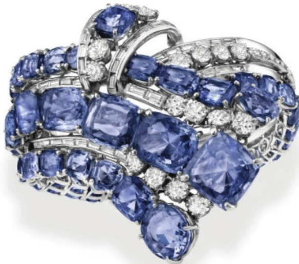
Important Bracelet in platinum with cascading blue Ceylon sapphires (130 cts) and diamonds (10 cts). Circa 1950.