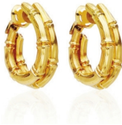
Cartier Bamboo hoop earclips in 18k yellow gold. Made in France, circa 1980.