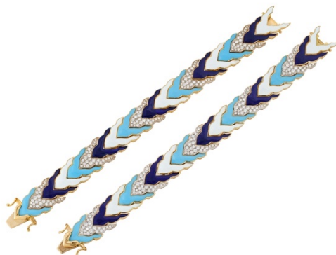
Bulgari Enamel & Diamond Bracelet Pair

A chic pair of enamel, diamond, and 18k gold bracelets by Bulgari, in the original box. Made in Italy, circa 1960.