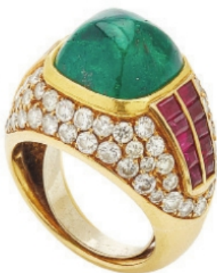
Ring in yellow gold with emerald (25 cts), pink sapphires and diamonds. Made in France, circa 1960.