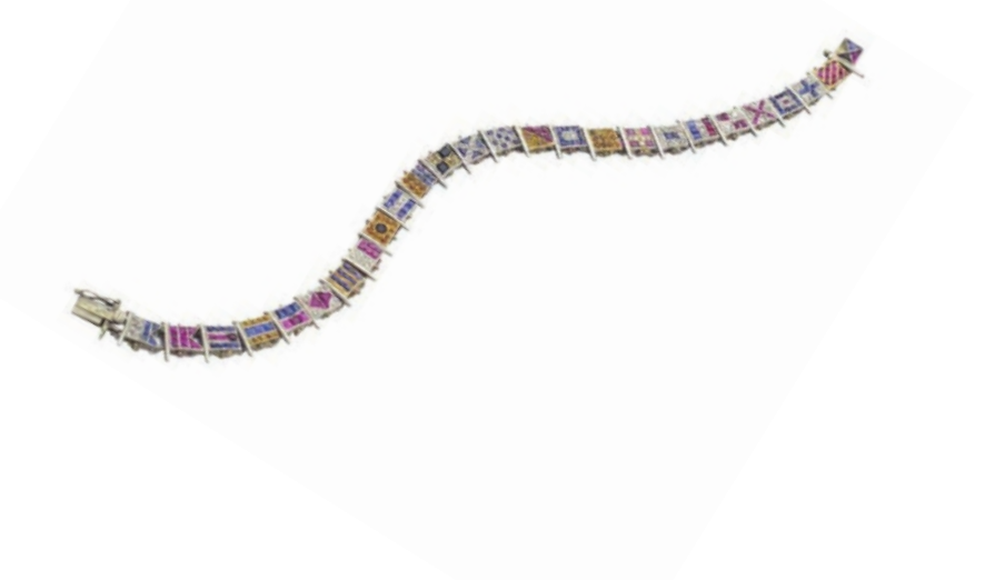
Art Deco maritime signal flag bracelet set with various gemstones and rose diamonds. Circa 1920.