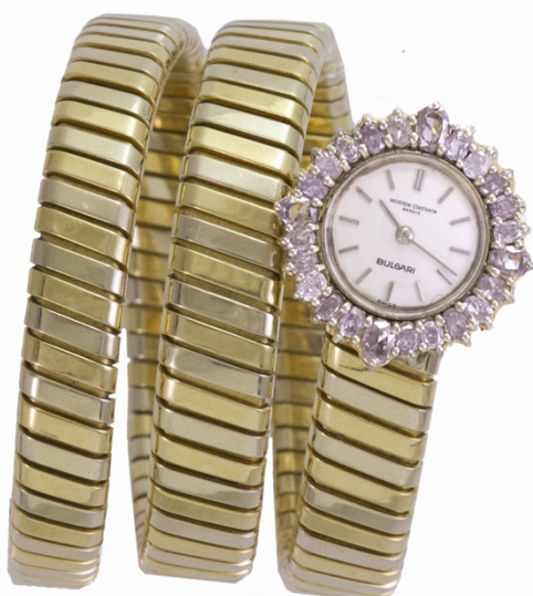
One of a kind Bulgari Serpent Three Colors Gold Tubogas watch with pink diamonds framed dial. Made in Italy, circa 1970.