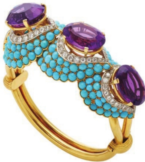
Bracelet in 18k yellow gold with three amethysts, turquoises and diamonds. Made in France, circa 1950.