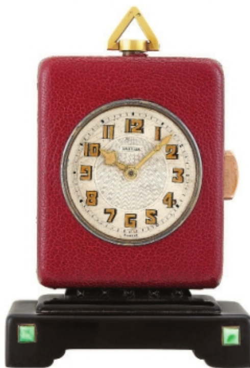
Cartier gold and gutta percha miniature desk clock. Mechanical, back key-wind and set, centering a circular silver-tone engine-turned sunburst patterned dial with Arabic numerals, minute indicator chapter ring and ornate gold hands, within a decorative engraved bezel and a rectangular gutta percha case and footed base with gold floral trim and two applied plaques, circa 1910-1919.