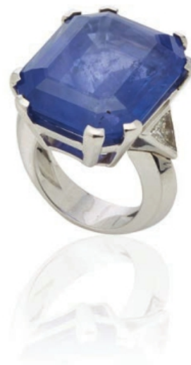
Ring in white gold with octagonal step cut sapphire (Ceylon, unheated, 49.98 cts). Circa 1960.