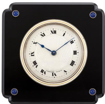
Cartier Art Deco black onyx and cabochon sapphire desk clock. Made in Paris, circa 1925.