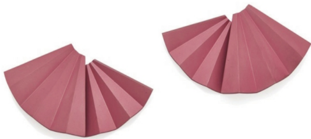
JAR fan earrings in sculpted aluminum with mauve matte colored finish. Circa 2002.