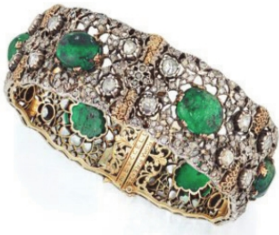
Buccellati Emerald and Diamond Bracelet mounted on 18k white and yellow gold. Made in Italy, circa 1960.