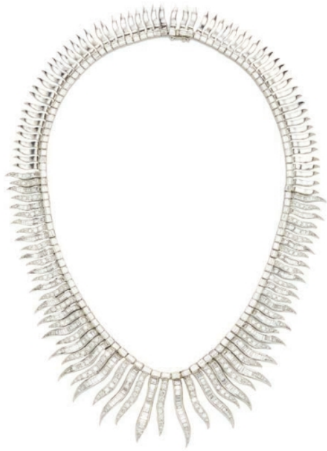
Articulated sunburst necklace in 18k white gold with brilliant and baguette cut diamonds. Circa 1970.