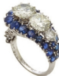
Van Cleef & Arpels ring in white gold with 3 diamonds and sapphires. Circa 1955.