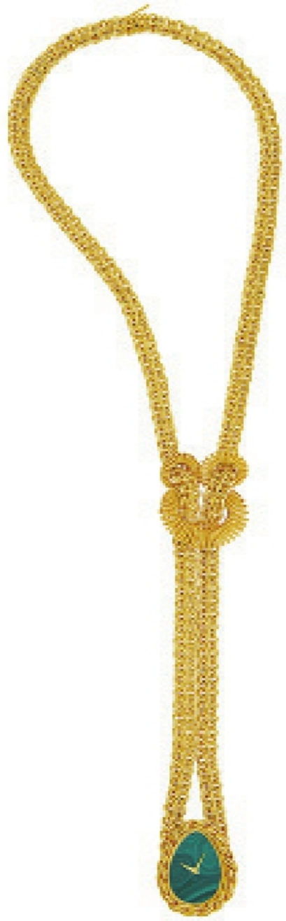
Piaget pendant-watch necklace in malachite and 18k yellow gold. Made in Switzerland, circa 1970.